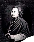
Bishop Daniel Delany Founder

A Christian Minority Institution of the Brothers of St. Patrick Affiliated to the University of Madras & Accredited 'A' Grade by NAAC. Canal Bank Road, Gandhi Nagar, Adyar, Chennai - 600020.