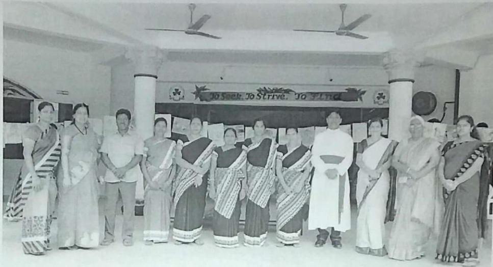
Literacy club team with management