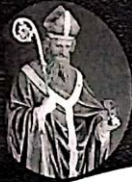
Saint Patrick Patron