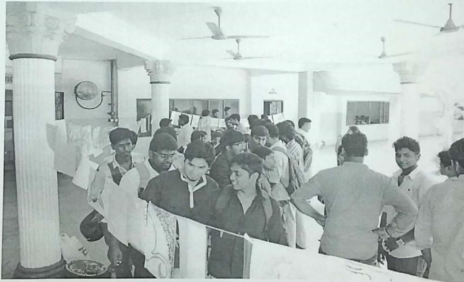
Students Visit to Talent Show