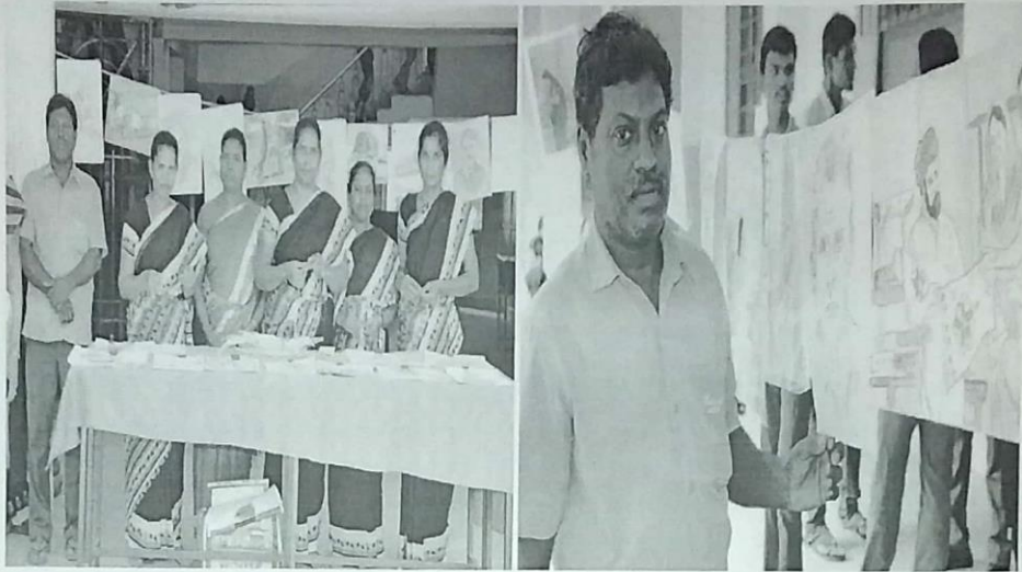
Exhibited handicrafts created by Women support staff and Karuppanan Paintings & Drawings